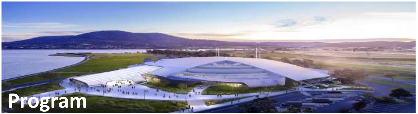
My State Bank Arena