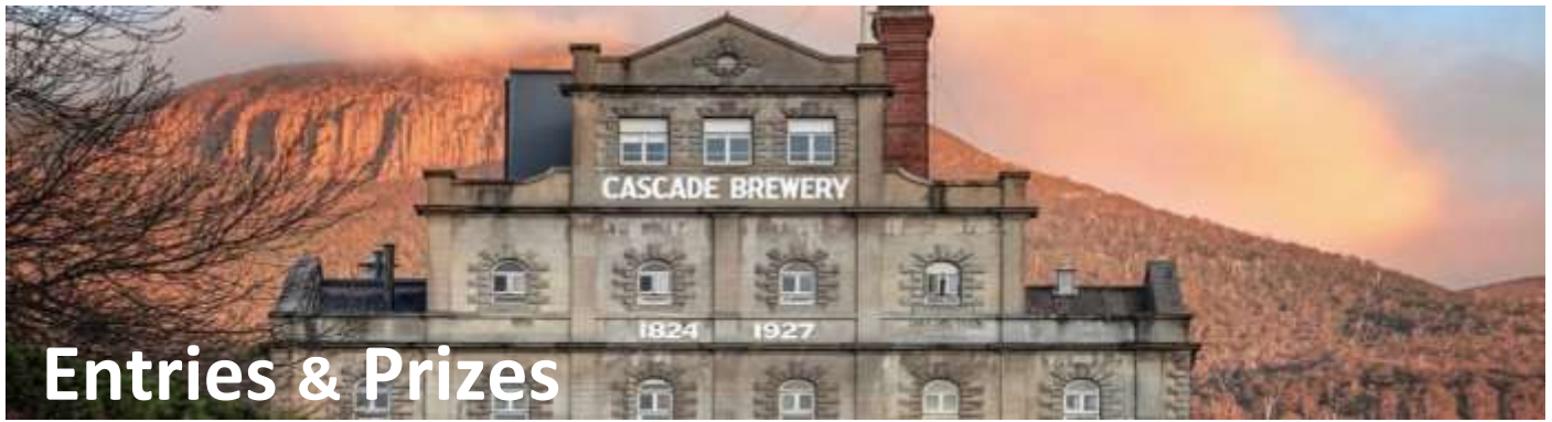
Cascade Brewery by Deni Cupit